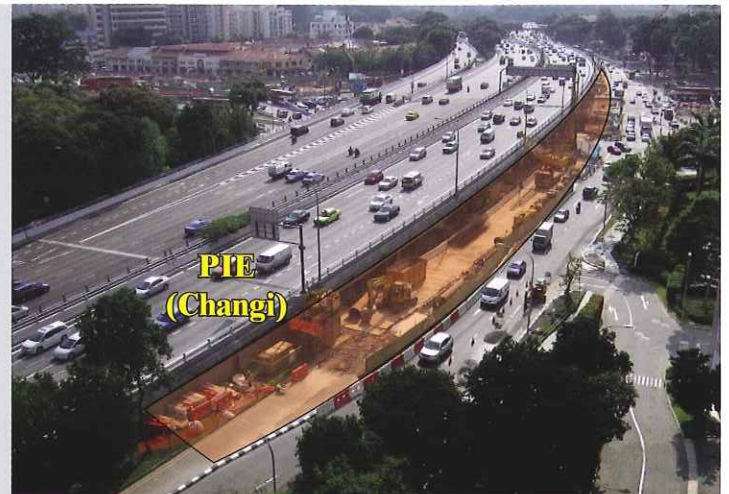
Location of flyover viewed from Jalan Kolam Ayer

To facilitate the construction, some night works involving the launching of the pre-cast concrete beams will be carried out and these works will require temporary road closure and traffic diversion. Coordination, issuance of the necessary advance notifications and placement of adequate signages will be done to minimise any inconveniences.