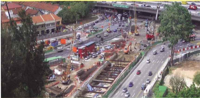
Excavation for road tunnels (Bendemeer Road)

We are pleased to share that we have completed the Diaphragm Wall of the road tunnel and our project is well underway with the excavation and construction for the remaining structures of the road tunnels.