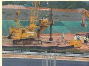
Slope Protection & Silt Fence for Construction of Flyover Bored Piles