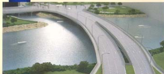
Artist impression of the Bridge over Sungei Serangoon

The work is scheduled for completion by first quarter of 2009.