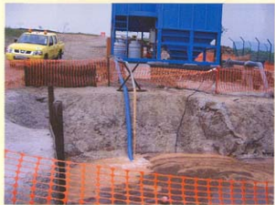
Using sedimentation tank for better environmental control