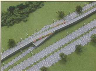
An illustration of the Vehicular Underpass

Upon completion, the new road will improve the accessibility of residents living in Sengkang and Punggol new towns. Travel time taken by motorists to the city will be reduced.