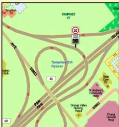
Tampines Avenue 5 turning into Pan Island Expressway (towards Tuas)