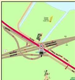
Seletar Expressway (towards Bukit Timah Expressway) - Yishun Exit 3

Land Transport Authority Roads Customer Relations Division 1 Hampshire Road Block 9 Level 3 Singapore 219428