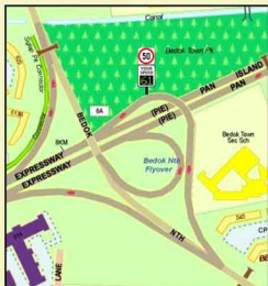
Pan Island Expressway (towards Changi) - Bedok North Exit 8A