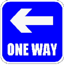
One-way street (One way street begins from this sign)