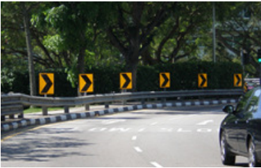
Curve Alignment Markers (Slow down and drive carefully at bends)